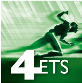
Image 2: New apps expand the functionality of ETS – the product and manufacturer independent commissioning tool for all KNX projects.